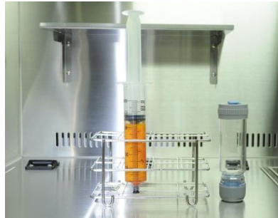
Preparation for SVF Isolation with Isolation kit