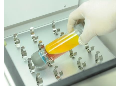
Enzymatic Digestion in shaking incubator