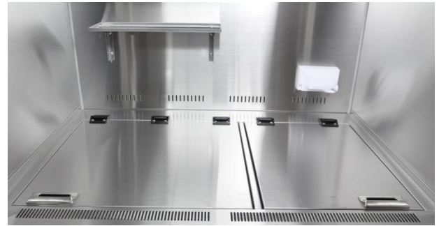
<Inside Work Station>