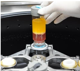
SVF Isolation by Centrifugation