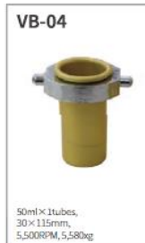
ADSc(SVF) Isolation Kit