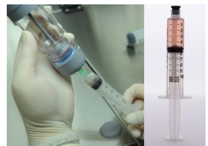
Final SVF Collection